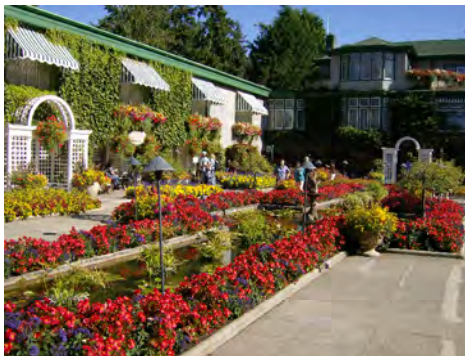
Italian garden at Butchart

There are 55 acres of gardens on the 130 acre estate, and it is still family-owned. The gardens have been designated a Nation Historic Site of Canada.