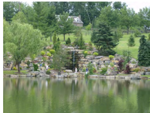
Quarry garden at Schnormeier

Check the website: www.schnormeiergardens.org .